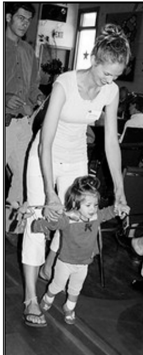
First steps on the path