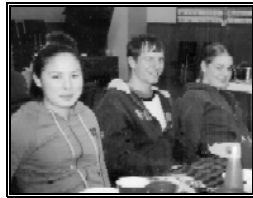
Teens, Spanish Dinner