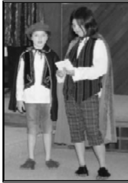
Hobbits find courage