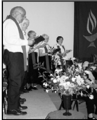
Our church choir singing

Several times during the year, the full service is inter-generational, often including drama and music.