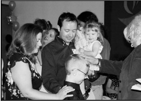
(Child Dedication, June 2007)