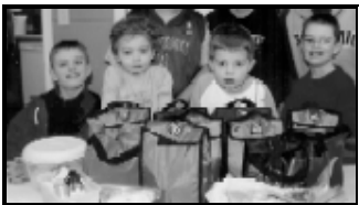
Care kits for the homeless