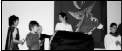
Donkey in "A Feast of Fools"