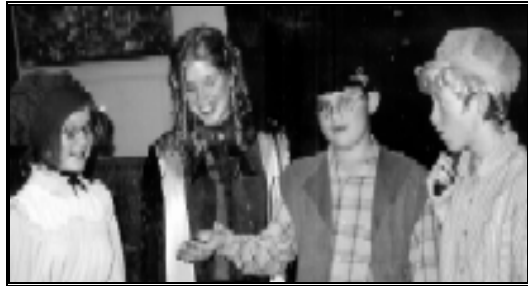
Youth in cast of "A Christmas Carol"