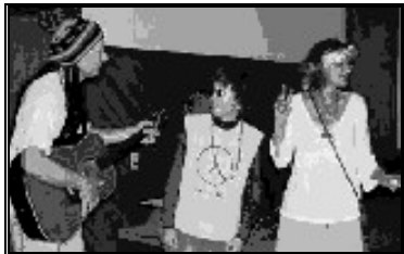
Family folksingers as part of an intergenerational service

Please arrive in time for you and your children to get settled in before the service starts, so you can relax and take part in worshipping together. Children above nursery age must be upstairs with their families during this time, as there is no supervision downstairs.