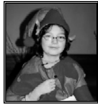
Narrating X-mas Play