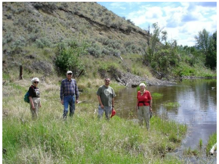
UUFK Victoria Day Walk along Tranquille Creek took us to a beaver dam.