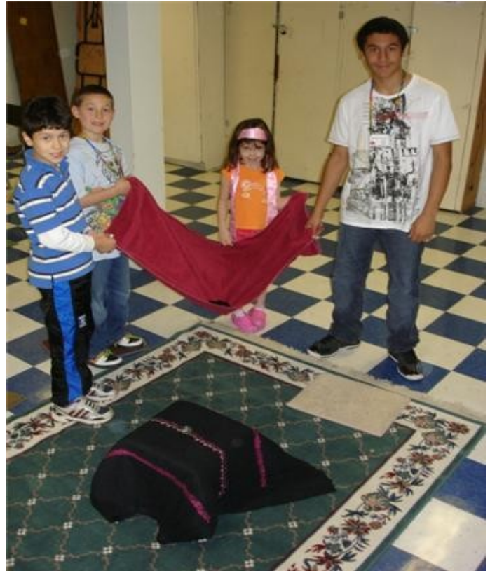
UU Kids role-play bringing the sacred black rock to the east corner of the Kaaba in Mecca, part of our "Mohammed's Story" session.