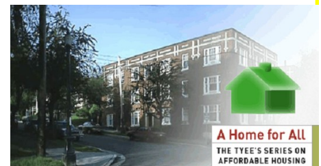
Pictured above, one of the buildings of